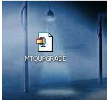
Zipped upgrade file saved to desktop